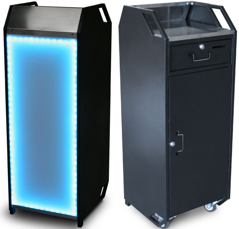
Shown above with LED Kit upgrade